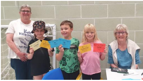
Llongyfarchiadau i blant yr Ysgol Sul ym Mabolgampau MIC